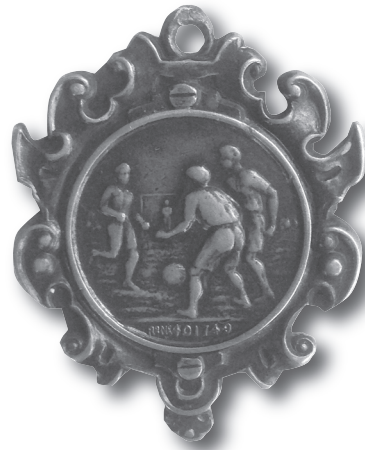
ECFC 1905 East Devon League Medal. Grecian Archive