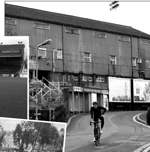
The Old Grandstand from Well Street prior to demolition, 2017. Will Barrett