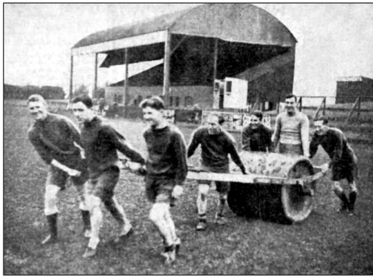
Above: Exeter City players in front of the Old Grandstand, 1921.