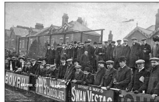
Exeter City vs Watford, St James' Road end, c.1920.